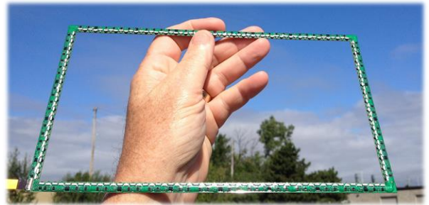
LCIR Touch Sensor